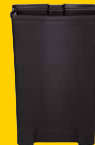
SINGLE-STREAM RIGID LINER