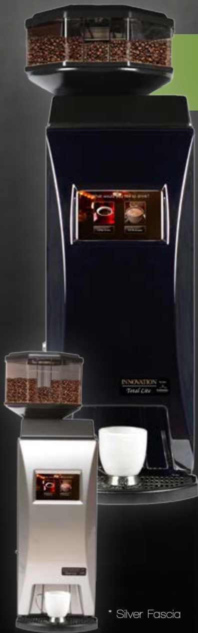
* Silver Fascia